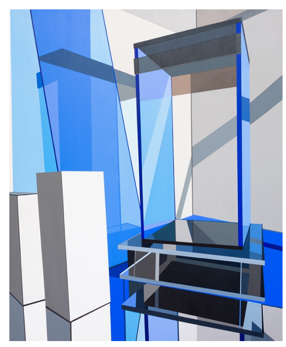
Tommy Fitzpatrick, Monolith , 2018 Acrylic on canvas, 72 x 60 inches

In Pavilion, Fitzpatrick's shades of pink, salmon, red, and peach create a window-like rectangular form, against which leans a panel that seems to reflect a two-shelved Plexi display case, its shelves with tones of teal, gray, green, and crimsony-pink. The seemingly dual-tone palette of the canvas is infinitely complex, its surfaces and assumptions