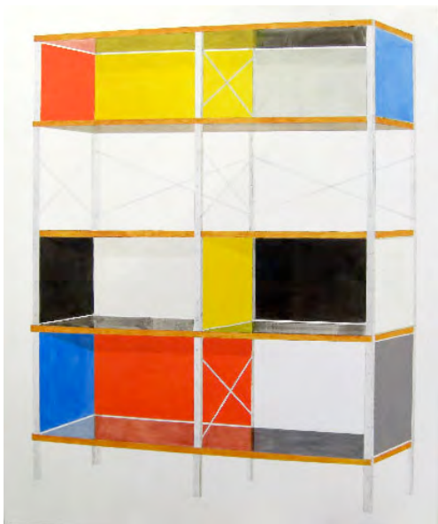
Darcy Huebler Open System (ESU #4), 2008 Acrylic on canvas, 85 ½ x 67 inches

In the north gallery, California-based artist Darcy Huebler presents six new works including two large canvases that, at first glance, are boldly representational. Open System (ESU #3) and Open System (ESU #4) reproduce Eames Storage Units, depicting each cabinet life-sized and slightly angled toward the viewer. Originally built in 1950, the configurable ESUs of Charles and Ray Eames were a precursor to "modularity" in design. In Huebler's hands, the display units are presented as floating abstract grid-like compositions of color and shape. Complementing these images are four smaller, thoroughly abstract works that offer a purely retinal experience of graphic color and undulating line. Together, Huebler's Thought Process challenges viewers to appreciate that representation and abstraction can be simultaneous phenomena.