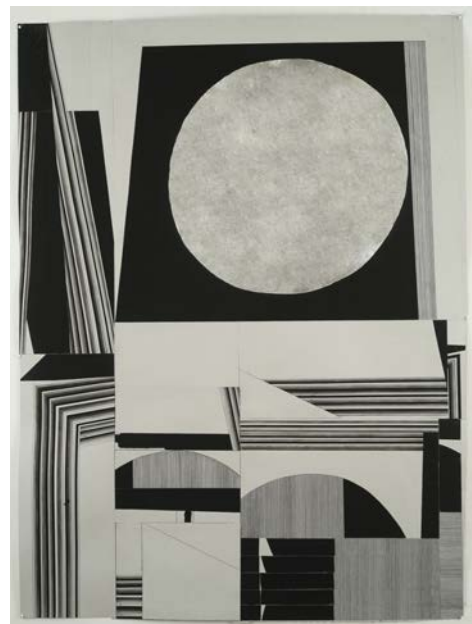
image: Shaun O'Dell, 2nd Feelings. #2, 2011 gouache, ink and silver leaf on collaged paper, 40 x 30 inches