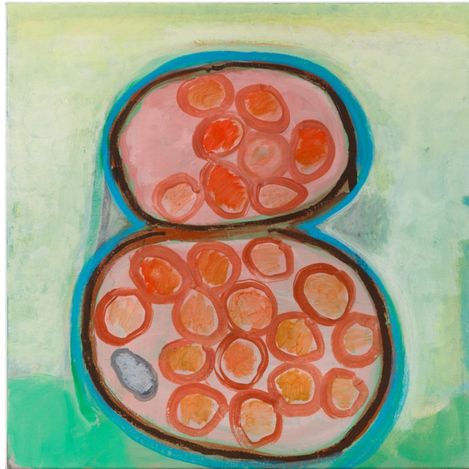
Richard Brown Lethem, Russets, One Stone , 2022 acrylic and charcoal on canvas 24 x 24 x 1 3/8 in (61 x 61 x 3.5 cm)

Richard Brown Lethem (b. 1932) has been living and thinking in paint on canvas since the 1950's, with results that have been categorized, more or less aptly, as abstraction, expressionism, figuration, social realism, surrealism, and allegory. Now in his '90's, Lethem's imagery has become unified and direct, often consisting of a central form derived from nature, yet distilled, by the visionary pressure of his attention, into symbols seemingly directly drawn from his psychic landscape, and beamed into that of the viewer. If this is an example of "late style," it is one defiantly uninterested in a modest contemplation of mortality; instead, the painter's wisdom exalts an embrace of color and sensuality, and traces the joyous mystery of our consistent presence as neighboring bodies in a shared field of space.