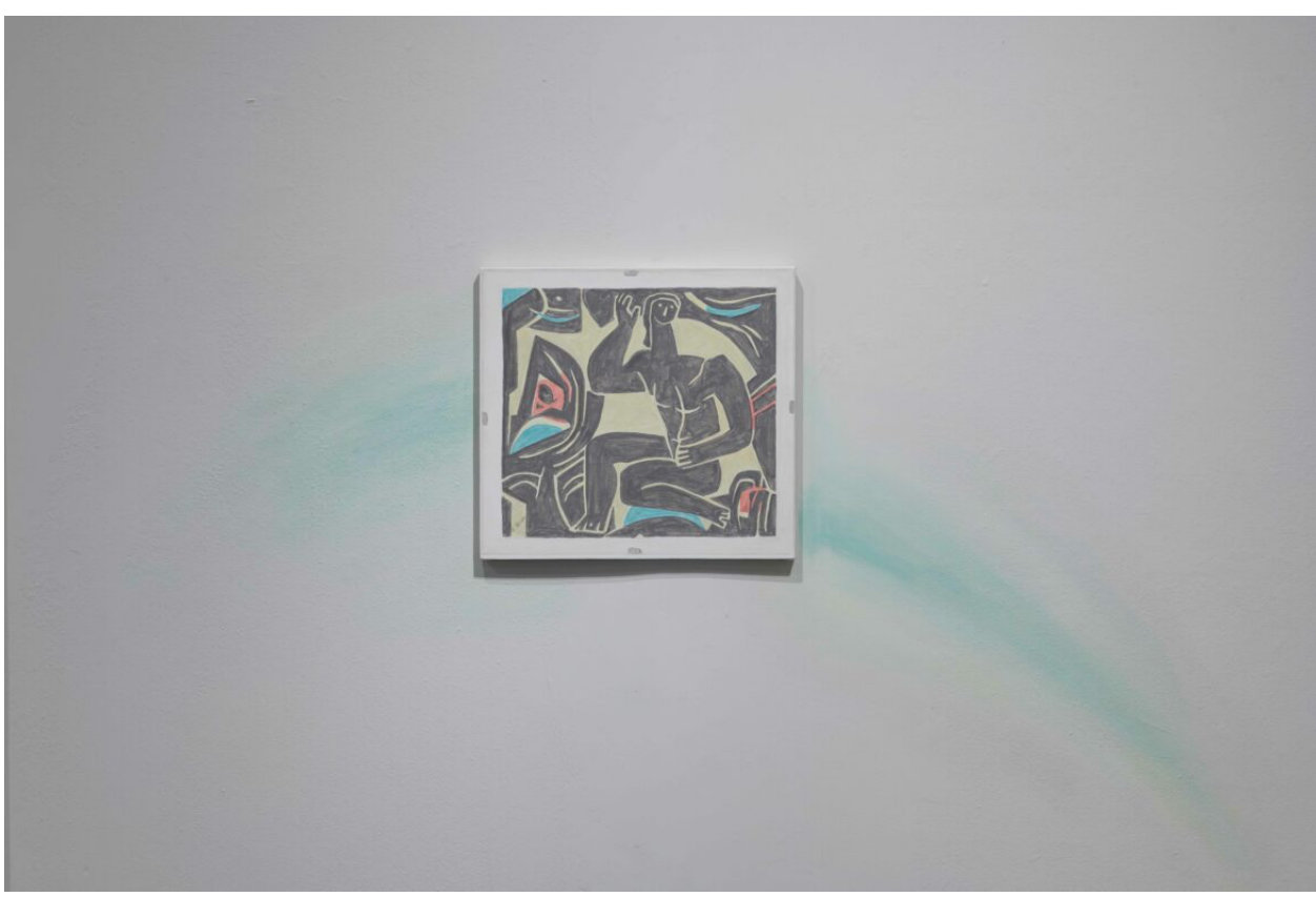
Francesca Fuchs, "Beise 3," 2020.

FF: The pandemic has been a way of reassessing many things. On the whole, I think I have learned a lot of patience, and I've learned that I am not in control in a very fundamental way. I know that we are always living in the illusion that we are in control; however, that illusion does not operate anymore due to the pandemic. I've gotten more comfortable with the fact that control is mostly an illusion. The pandemic has also opened up my whole perspective on perfectionism. As an artist, I want things to be a certain way, and I make sure they are that certain way: I'm sure I'm a pain in the butt to work with at different points. I always feel like my work is operating on a little tight rope or knife's edge, and if the show is not just right, my work will fall off and not work. I've had to work within this ideal perfectionism and allow for those glitches and delays. I feel like rhythms have changed because of the pandemic.