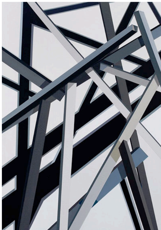
Tommy Fitzpatrick, Crow's Feet , 2015 acrylic on canvas 31 x 24 inches