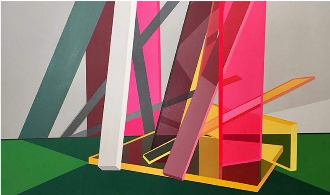
Tommy Fitzpatrick, Portico (detail), 2017, acrylic on canvas, 32 x 40 inches (courtesy of Holly Johnson Gallery).

Tommy Fitzpatrick's current exhibition Crystal Cities , on view through Nov. 4, includes ten compelling, colorful, acrylic-on-canvas paintings of interlacing planar forms that command the main space of Holly Johnson Gallery. A separate area features a wall-mounted shelf of small-scale Plexiglass maquettes with interchangeable parts, which Fitzpatrick used as models for his paintings.